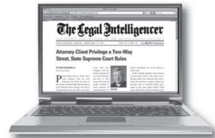
E-Print, PDF w/ distribution license