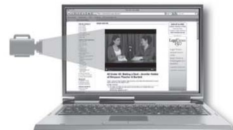
Include Hyperlinks Embed Trial Footage in Your E-Print and/or URL on Your Printed Collateral Repurpose as An Advertorial