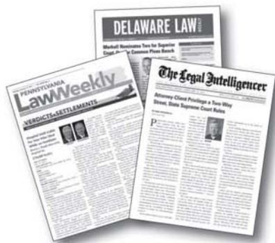
Hard Copy Reprints